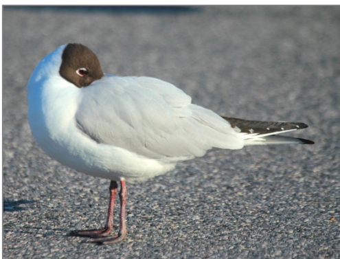
Black-headed Gull – Hunt Valley Towne Center Russ Ruffing

The Hunt Valley Black-headed Gull , which had overwintered and persisted until late March of 2013, returned for its FOURTH known winter in the fall. This year it showed up a few days later than the previous year, and after about mid-December it became quite scarce. This trend continued into 2014 where the bird was seen very irregularly until the month of February, after which it seemed to return to a more normal routine.