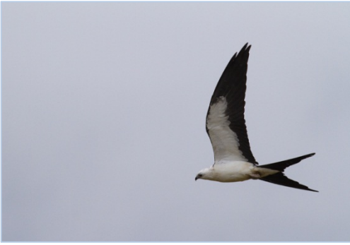
Swallow-tailed Kite – Washington County Bill Hubick

Whereas 2012 produced an amazing number of new early spring arrival records for multiple species in multiple counties, to many it seemed as if the spring migration of 2013 took forever to get started. Typically, the first week of May is the hottest week for warblers, but many birders were lamenting an almost complete lack of birds that week. Wonderful conditions for movement overnight on Friday May 10 and into the morning of Saturday May 11 seemed to dump the entire stock of birds out upon the state, at least in many locations – finally! Needless to say, there were precious few new arrival records set in 2013, but perhaps the most astounding early record was Jim Wilkinson's new state-early record of Louisiana Waterthrush at Howard County's Font Hill Wetland on Feb. 16; this bird beat the old record by 12 ridiculous days!