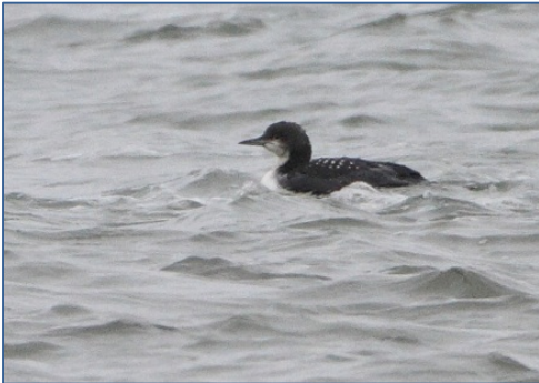
Pacific Loon – Ocean City Inlet