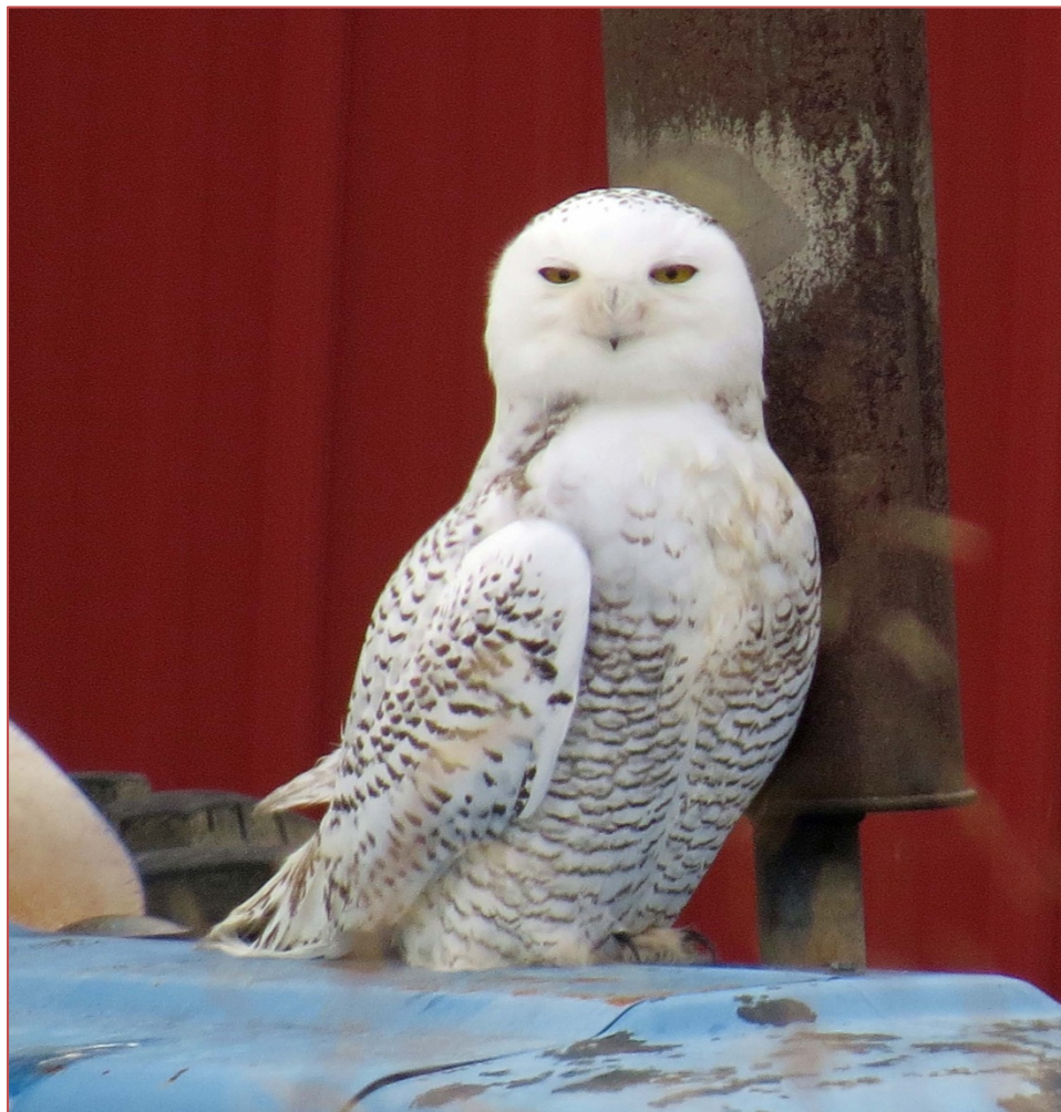
Snowy Owl – Calvert County Joe Hanfman