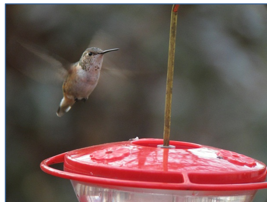
Rufous Hummingbird – Ellicott City