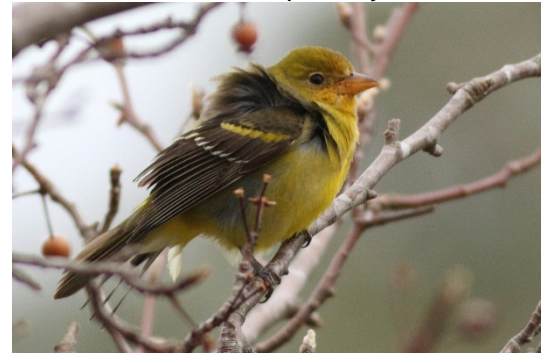
Western Tanager – Deer Run Golf Course